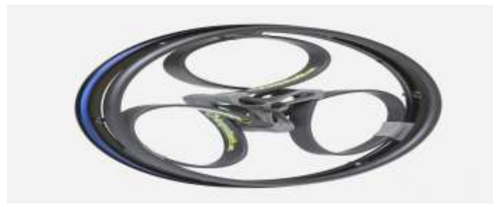
Fig. 1: Loop Wheel

A Loopwheel is a wheel with integral suspension, designed for better shock-absorbing performance and greater comfort. Loopwheels give you a smoother ride. They are more comfortable than standard wheels: the carbon springs absorb tiring vibration, as well as bumps and shocks. They're designed for everyday use and are strong and durable. The loopwheels for wheelchairs help people push over uneven streets, rough tracks and gravel paths, with less effort, and the carbon springs give you extra power to get up or down kerbs. They reduce jolting and vibration, by as much as two thirds compared with a spoked wheel. They made the decision to focus just on wheelchair wheels because the demand for these was really strong, and but it is very small company. A loopwheel for bikes is an awesome ride. As we know because we've tried them a lot.